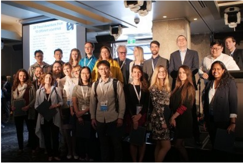
IFSI Travel Grant Winners 2019

With 24 travel awards sponsored by Menlo Therapeutics, private donations, Trevi Therapeutics, Kiniksa Pharmaceuticals and Toray Industries the conference was also for young scientists an attractive possibility for sharing their knowledge about itch.